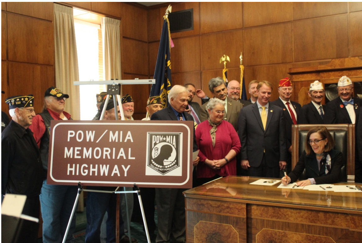
HALF SCALE POW/MIA MEMORIAL HIGHWAY SIGN WITH GOV. BROWN SIGNING HB 3452 SEPT. 16, 2019